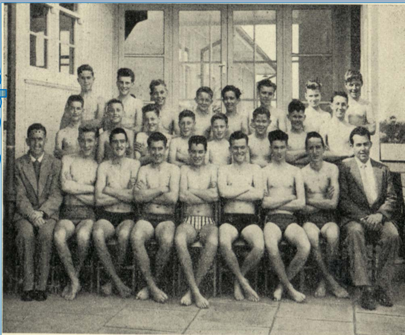
C.H.S. SWIMMING REPRESENTATIVES, 1957